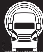
Over-dimensional and overweight freight